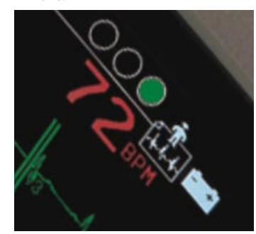
Marquette Hookup Advisor<sup>TM</sup> signal quality analysis program