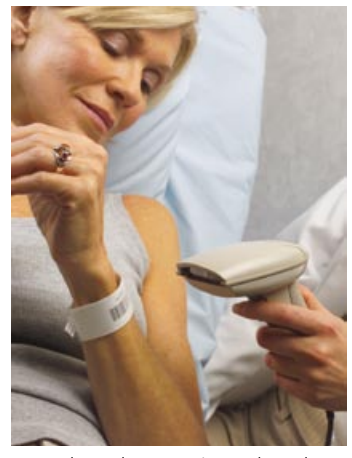
Barcode and magnetic card reader