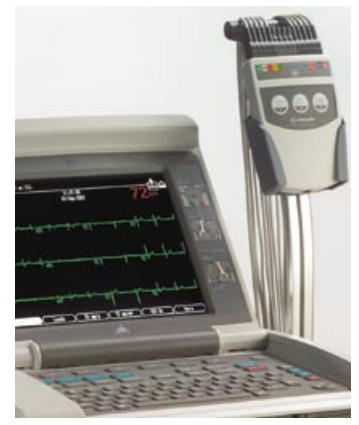
Digital CAM-14 module