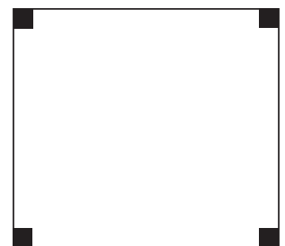
Bottom view showing smooth Velcro squares

7. To move surface, squeeze locking handle, move surface to desired location and release.