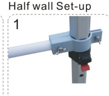
Attach one halfwall bracket to one tent pole