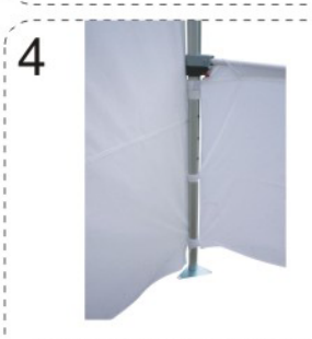
Attach each side of pole to pole collar; Secure with Velcro strip (x3)