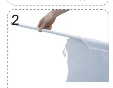
Apply halfwall panel on provided halfwall pole