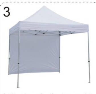
Fullwall application is complete