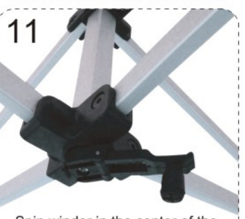
Spin winder in the center of the frame to completely tighten tent