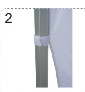
Secure to side poles with Velcro strips (x4 per pole)