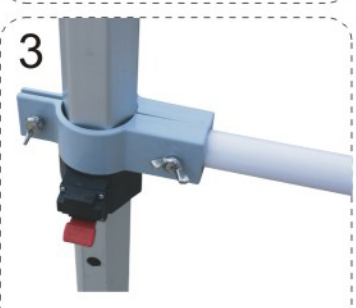
Attach second halfwall bracket to opposite tent pole