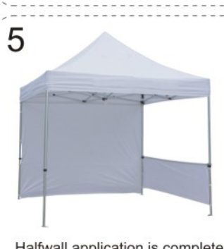
Halfwall application is complete