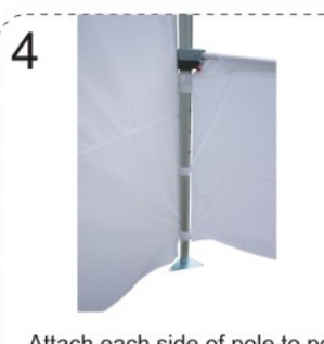
Attach each side of pole to pole collar; Secure with Velcro strip (x3)