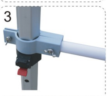
Attach second halfwall bracket to opposite tent pole