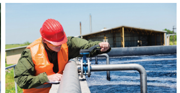
SEWER | WASTEWATER