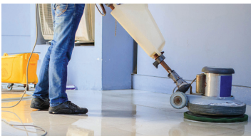
FACILITIES & BUILDING MAINTENANCE