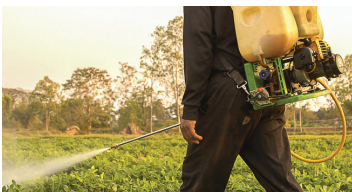
HERBICIDE | INSECTICIDE