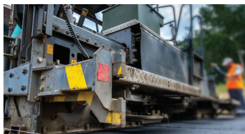
ROADS & STREETS