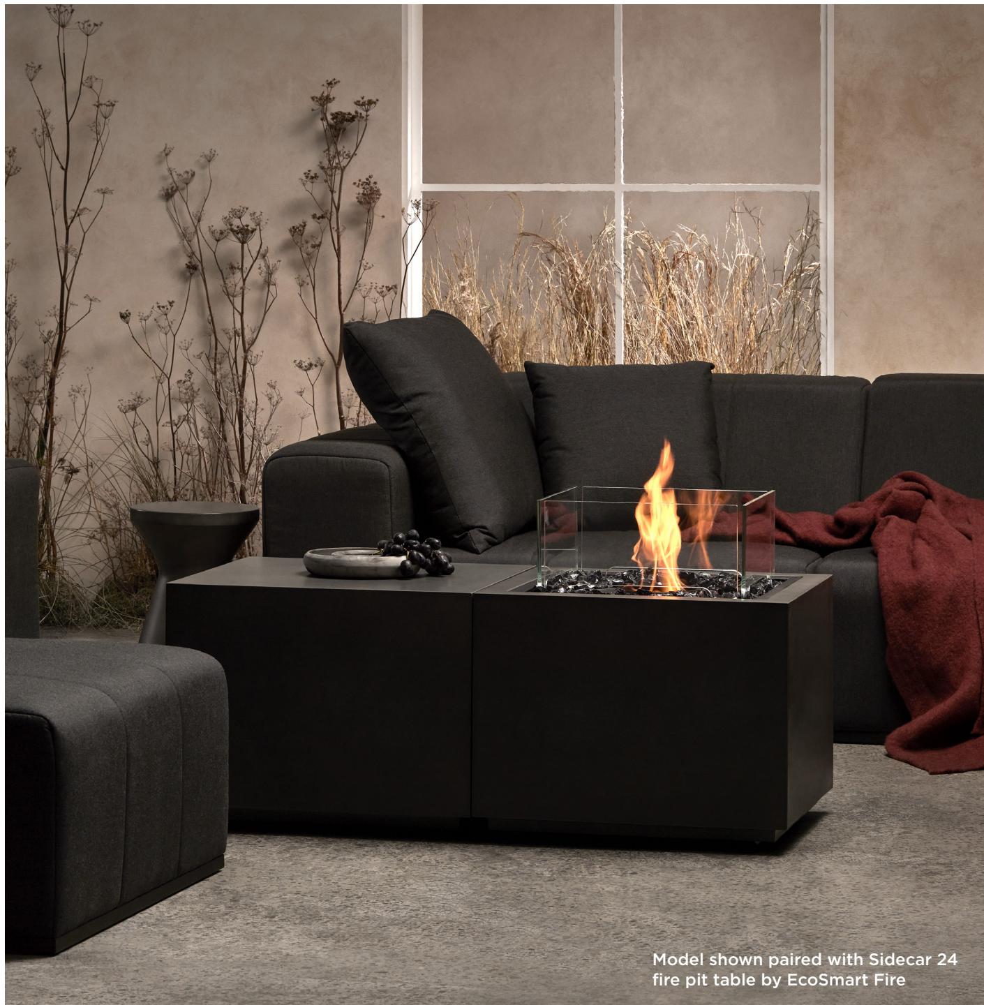
Model shown paired with Sidecar 24 fire pit table by EcoSmart Fire