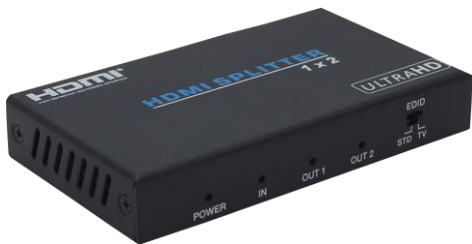
DVDO-Splitter-12 1x2 HDMI 18Gbps Splitter