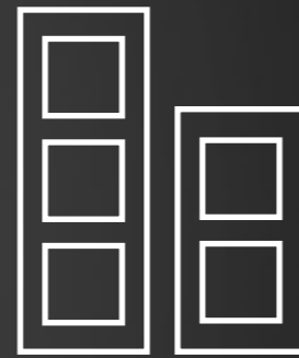
Surface installation frames ZVP-CB1M/2M/3M