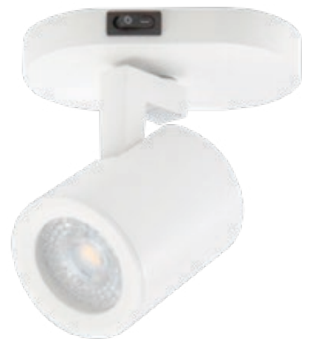
Complete With Switch