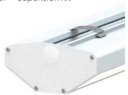
Spring Clip Mount