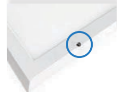
Installation Hole To Screw Directly Onto Ceiling