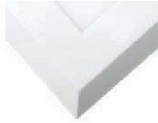
SlopeFrame Design, Blow Dust Away Easily