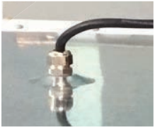
M12 Cable Outlet