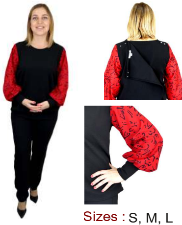
Sizes : S, M, L