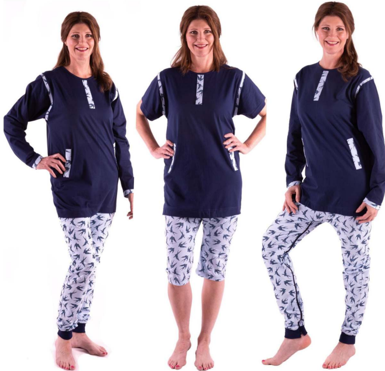
Long Sleeves and Long Trousers