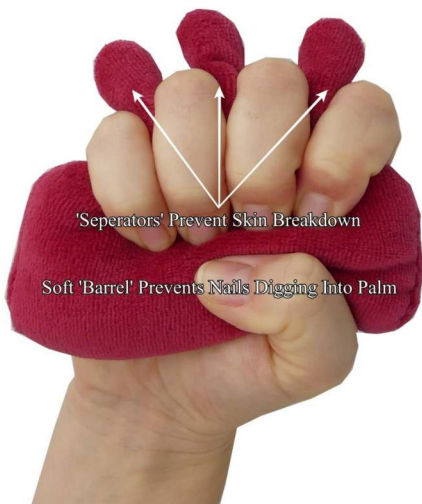
M113 M112 M083 M063

The short finger stubs stop the skin touching, as well as preventing skin deterioration at the base and between the fingers.