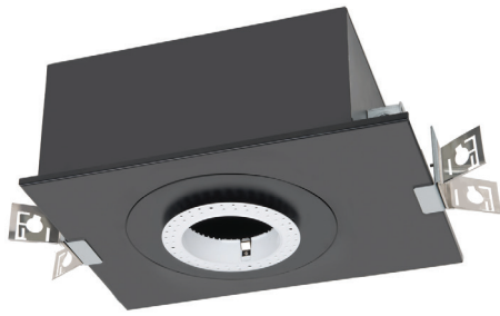
Round New Construction