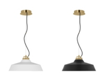
Matte Nightshade White/Natural Brass Black/Natural Brass