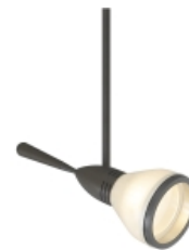
Antique Bronze With Round Glass Shield Accessory