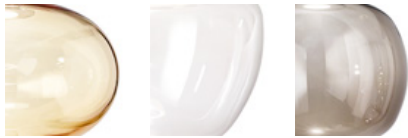
AMTR CRTR FUTR