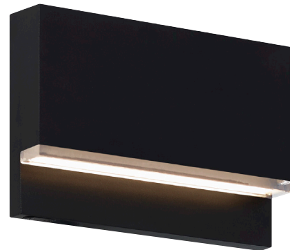
WEND OUTDOOR WALL/STEP LIGHT shown in black

* Visit techlighting.com for specific warranty limitations and details.