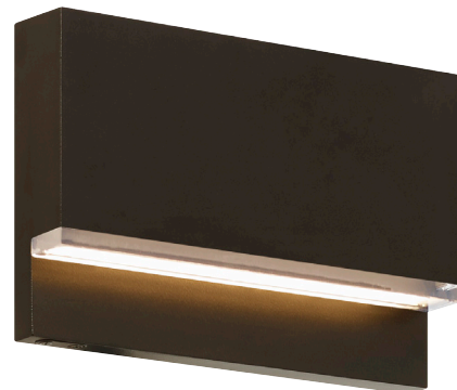
WEND OUTDOOR WALL/STEP LIGHT shown in bronze