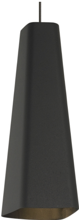
Textured Black / Black

Rated for (1) low-voltage, 50 watt max. lamp (Lamp Not Included). LED includes 12 volt 6.5 watt, 485 delivered lumens, 3000K replaceable LED module. Ships with six feet of field-cutttable cable. Dimmable with low-voltage electronic or magnetic dimmer (based on the transformer).