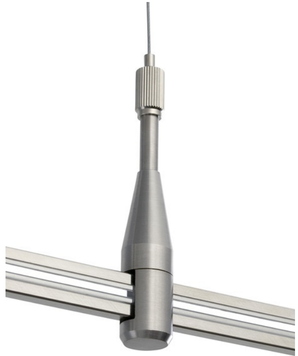
MonoRail Adjustable Standoff

It is best used on fairly straight runs with a drop greater than 6". A wire grip allows you to easily shorten or lengthen the cable to size it for use. Use standoff supports every three feet of MonoRail run and at corners. Standoffs can be positioned to cover points where rails are joined.