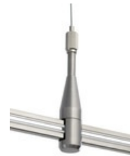
MonoRail Adjustable Standoff