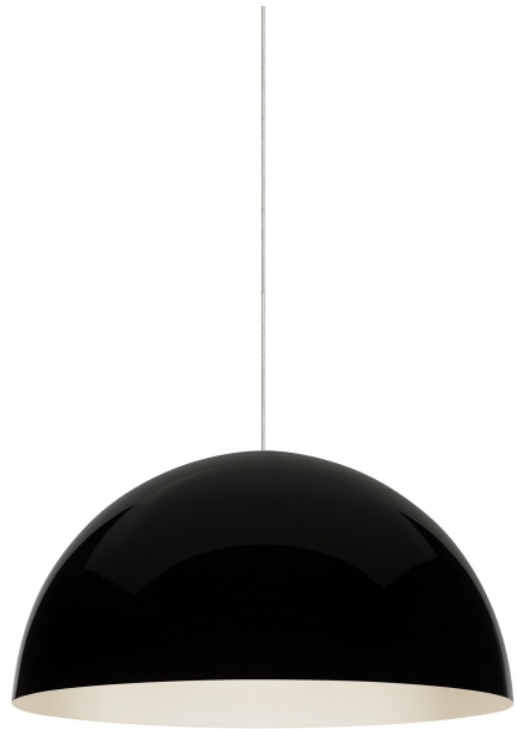
High Gloss Black / White

Includes 12 volt 5.8 watt, 221 delivered lumen, 3000K, integrated LED module. Dimmable with low-voltage electronic or magnetic dimmer (based on transformer). Includes 6 feet of field-cuttable satin cable.