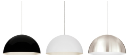
High Gloss Black / White