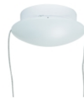
Kable Lite Surface Transformer-300W Mag