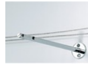
Kable Lite Outside Rigger