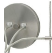
Kable Lite Center Power Feed Single-Feed