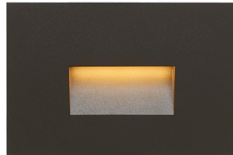
IKON OUTDOOR WALL/STEP LIGHT shown in bronze