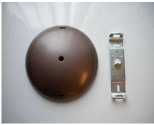
RFU775148 Tatou S2 Ceiling Rose Assembly Bronze