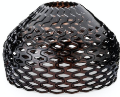
F7755048 F-S2 ochre-grey assembly diffuser