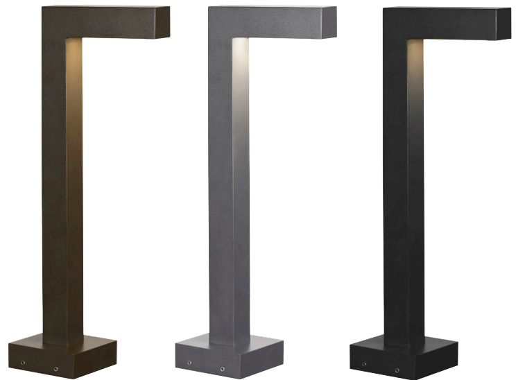
STRUT PATH shown in bronze