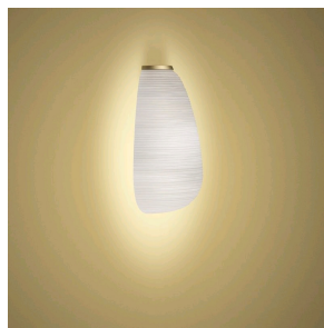
Rituals 1 Mix&Match