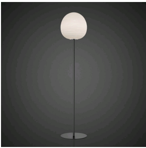
Rituals 1 Mix&Match