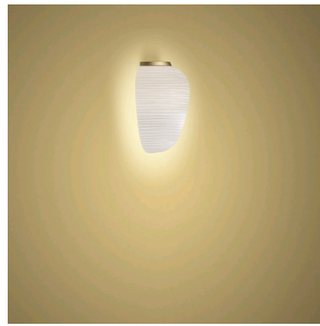
Rituals 3 Parete