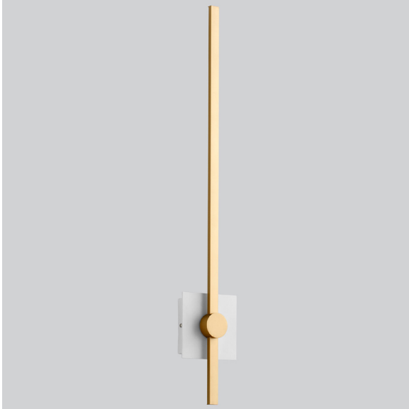
-650 White/Industrial Brass

FIXTURE TYPE _____ LOCATION _____ PROJECT _____ DATE _____