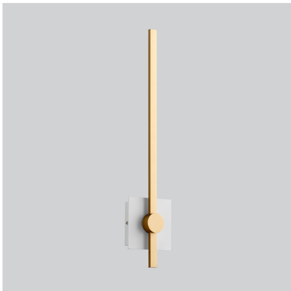
-650 White/Industrial Brass