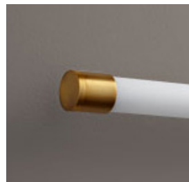
-40 Aged Brass