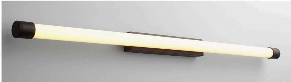
-22 Oiled Bronze