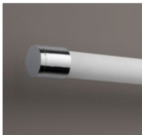
-14 Polished Chrome