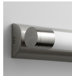
-24 Satin Nickel

LIGHT SOURCE 1 x 14W Florescent, T5 Linear fluorescent (mini bi-pin) (Lamp not included)