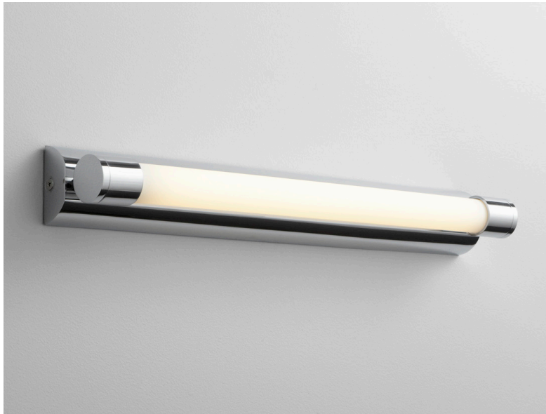
-14 Polished Chrome