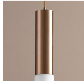
-25 Satin Copper