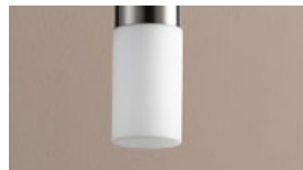
-1 White Opal Glass