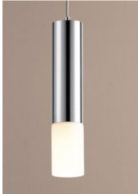
-14 Polished Chrome