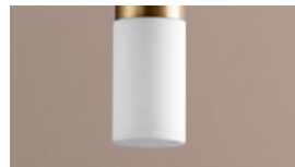
- Matte White Acrylic