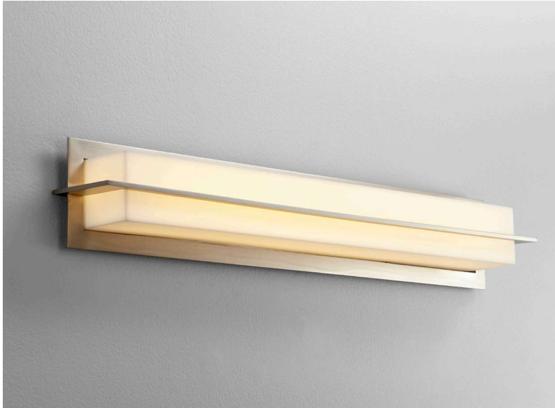
-24 Satin Nickel