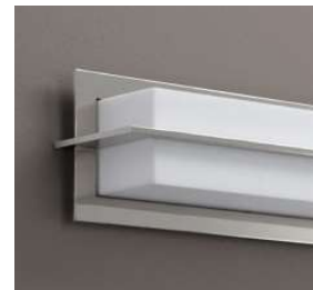
-20 Polished Nickel