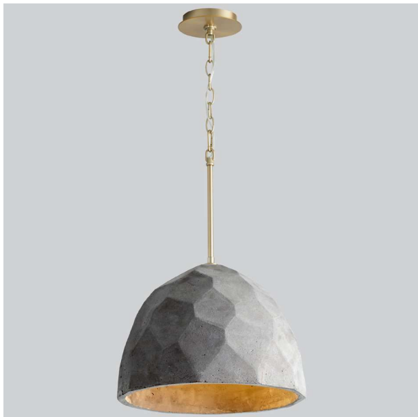
-1540 Dark Gray/Aged Brass Lit