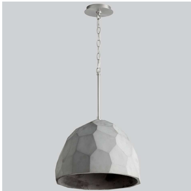
-1624 Gray/Satin Nickel