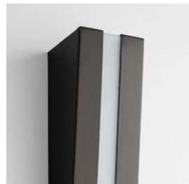
-22 Oiled Bronze