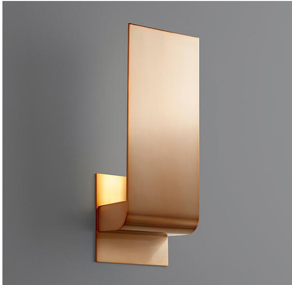
-25 Satin Copper