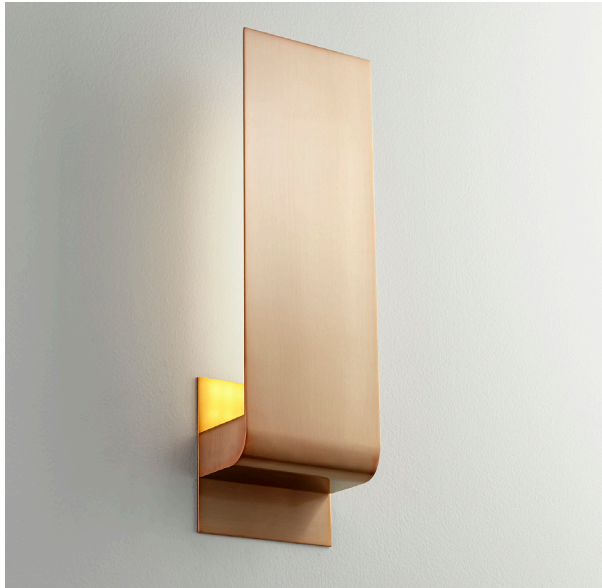
-25 Satin Copper