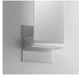
-14 Polished Chrome