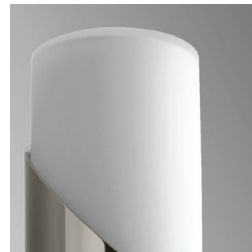
-1 White Opal Glass