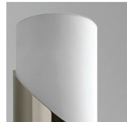
-2 Matte White Acrylic