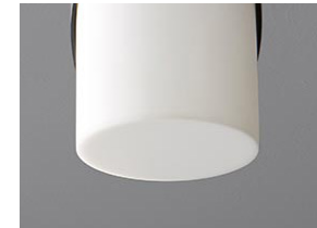
-2 Matte White Acrylic