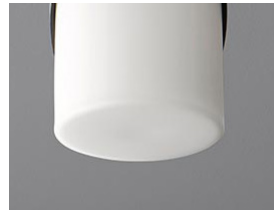
-1 White Opal Glass