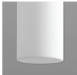
-1 White Opal Glass -2 Matte White Acrylic