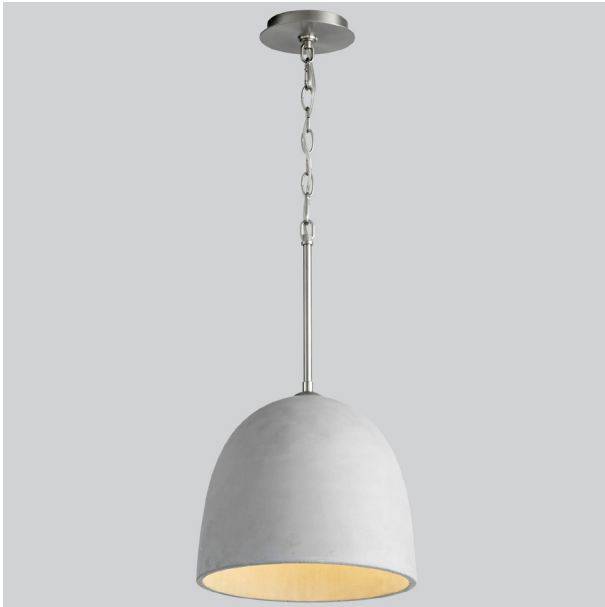
-1624 Gray/Satin Nickel Lit