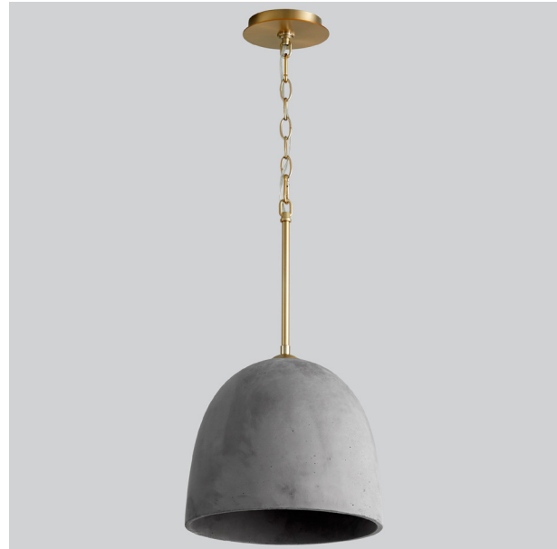
-1540 Dark Gray/Aged Brass