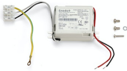
RF0410500 Power supply kit for Arrangements small & Noctambule