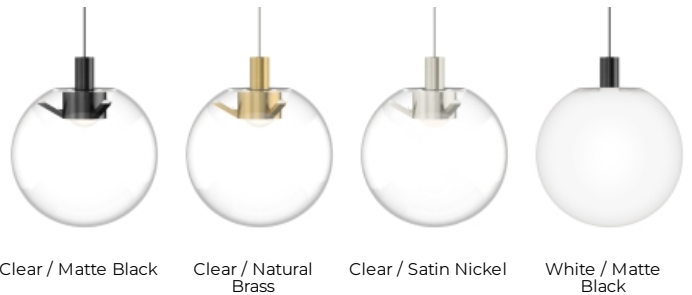
Clear / Matte Black