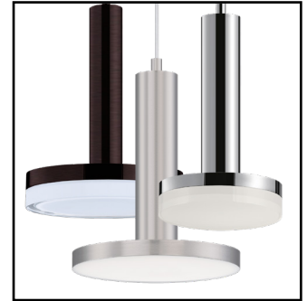
57600 PENDANT ACCESSORY (Sold Separately, Fixture NOT included)