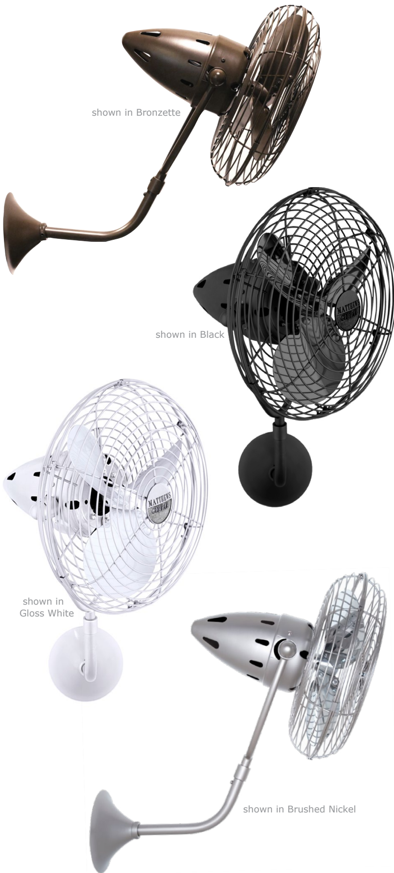
shown in Bronzette