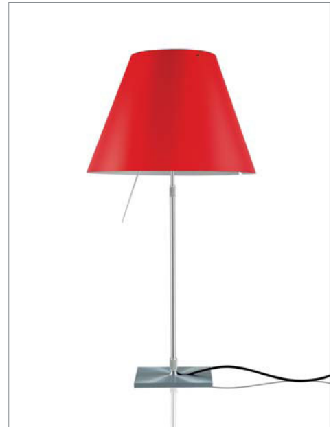
D13 - D13 c. (sensor dimmer) - D13i. (on/off switch)

Reference code : Complete Version D13c. 1D13N=00C520 alu body/white shade 1D13N=00C530 brass body/white shade D13i.f.c. 1D13N=01C520 alu body/white shade Structure D13 1D13N=000520 alu D13i. 1D13N=010530 brass D13i.f. 1D13N=01F520 alu D13N=01F503 off-white D13i.f.p.t. 1D13NPT1F520 alu Shade D13/1 1D13N0100502 white Mezzo Tono collection D13/1/2 1D13N0100537 comfort green 1D13N0100524 edgy pink 1D13N0100534 mistic white 1D13N0100538 soft skin 1D13N0100539 shaded stone Radieuse collectio n D13/1/2 1D13N0100508 primay red 1D13N0100501 liquorice black 1D13N0100536 petroleum blue D13N0100506 smart yellow 1D13N0100505 concrete grey