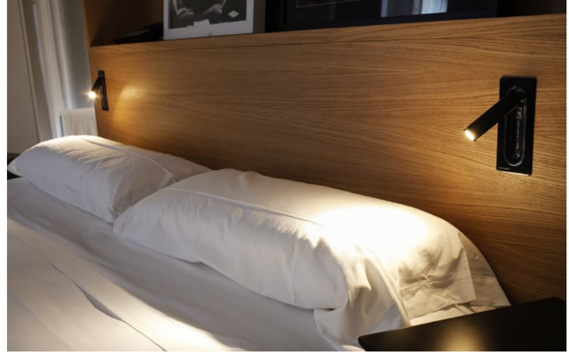
Ledtube (Ledtube RSC)