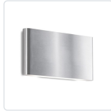
AT68010-BN Brushed Nickel