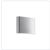
AT6506-BN Brushed Nickel